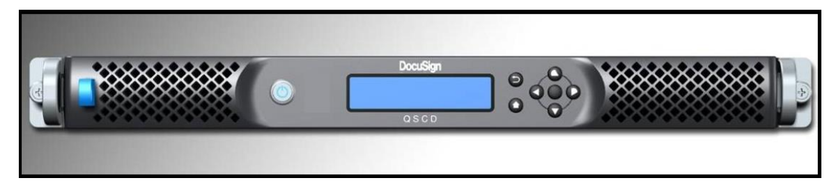
Figure 3 - DocuSign QSCD Hardware - Front